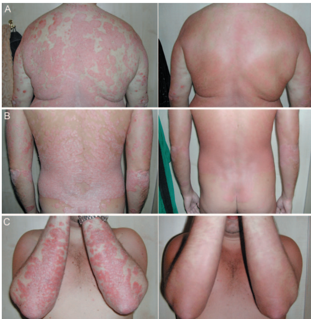
Figure 4. Three patients before and after a 3 week combined treatment with ichthyotherapy and UVA radiation.