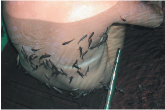
Figure 1. Patient sitting in standard treatment tub during therapy with the Kangal fish G. rufa .

skin scales of bathers, reportedly reducing illnesses such as psoriasis and atopic dermatitis (6).